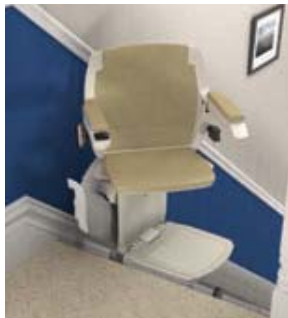
The swivel seat means no twisting of the body when getting on or off the Sherwood Stairlift

Here at Direct Stairlifts, we understand the difficulties that reduced mobility can bring; this is why we have created safe, simple and comfortable solutions to making long and painful trips up and down the stairs a thing of the past.