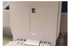
The on-board diagnostic digital display informs the user of the status of the stairlift at all times