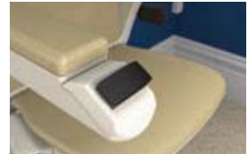
Easy to use controls are operated by the lightest of touch, even by those with limited dexterity