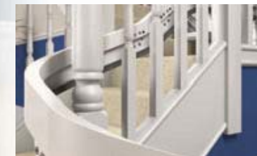
The unique modular curved rail system of The Sherwood Stairlift dramatically reduces installation time

Your truly exceptional experience with Direct Stairlifts will not end once your stairlift has been installed. Our unrivalled customer service and continuous support is just a phone call away.