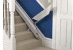
The unique modular curved rail system of The Sherwood Stairlift