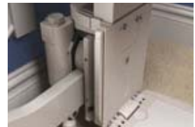
Multiple Safety edges ensure that the stairlift will stop immediately if an obstruction is encountered on the staircase