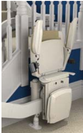
The Sherwood Stairlift has a slimline fold-away design which saves space and allows full access to the staircase